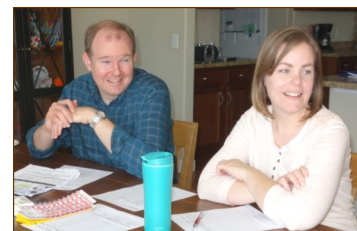
Direct Support Staff, John & Shannon House

God has provided this ministry with competent, compassionate, hard-working staff. Daily, they positively impact the lives of our residents as they assist them in all aspects of daily life — from teaching life skills to managing medical appointments — from cooking and cleaning to providing emotional support and community integration. The list goes on.